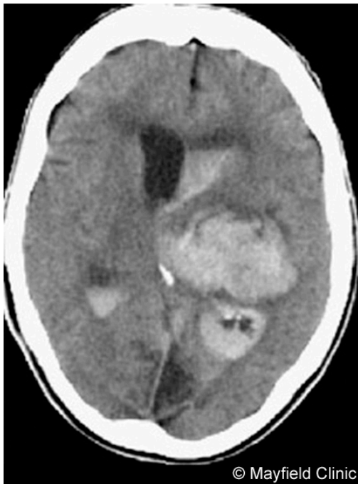
Figure 2. CT scan showing a large ICH.

Computed Tomography (CT) scan is a noninvasive X-ray to review the anatomical structures within the brain to see if there is any blood in the brain (Fig. 2). A newer technology called CT angiography involves the injection of contrast into the blood stream to view arteries of the brain.