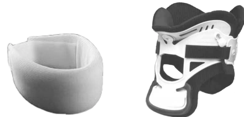
Soft cervical collar

Rigid braces are made from molded plastic with a removable padded liner in two pieces—a front and back piece—fastened with Velcro. This brace is used to restrict neck movement during recovery from a fracture or surgery (e.g., fusion). Common rigid braces are the Philadelphia collar and the Miami J collar.